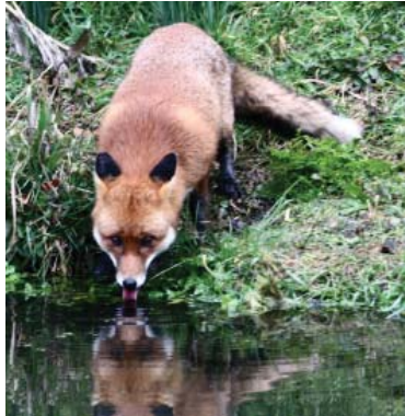
Your pond may even be visited by thirsty mammals such as foxes and hedgehogs

As with plants, there is no need to introduce animals into your pond. If the conditions are suitable, they will quickly find their own way and colonise naturally. You may attract all sorts of aquatic mini-beasts such as pond skaters, water boatmen, water beetles, snails, mayflies, caddisflies, damselflies and dragonflies, along with frogs, newts and toads. Do not transfer amphibians (either as adults or as spawn) between ponds, as this can spread disease and non-native plants. Do not introduce fish as they only occur naturally in very deep (or stream-fed) ponds and will reduce the wildlife value of any pond, feeding on dragonfly larvae, tadpoles and spawn. Do not install pumps, filters or fountains as they will remove all the smaller creatures that other wildlife depends upon for food.