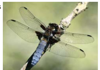
Invertebrates such as dragonflies are a wonderful sight.

Ponds are fascinating habitats and can be an invaluable resource for learning about nature and observing wildlife close-up, particularly for children. Just be aware of safety around water. Pond-dipping, watching changes through the year, and recording plants and animals present are just a few ideas.