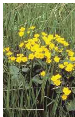
Marsh marigold.