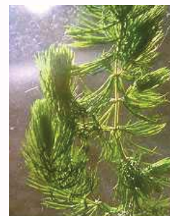
Hornwort.