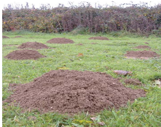
Mole hills.

One mole can tunnel up to 20m per day and produce a considerable number of hills, particularly where food is in short supply. Moles in your garden are not harmful as such but this activity is understandably very frustrating if you're trying to maintain a neatly manicured lawn. In agriculture, mole hills can also damage farm machinery or contaminate grass used to make silage, and surface tunnelling may affect crop growth.