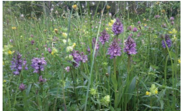
Wildflower meadow area.