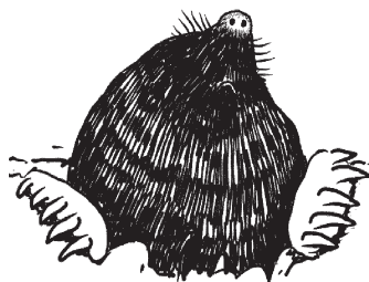
Illustration: Sarah McCartney.

Moles were once trapped for their fur and have long been treated as pests by many farmers, landowners and gardeners. Many are also killed on the roads or caught by cats and dogs. Natural predators include foxes, rats, badgers, stoats, weasels and birds of prey.