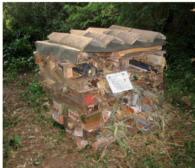
A wildlife tower.